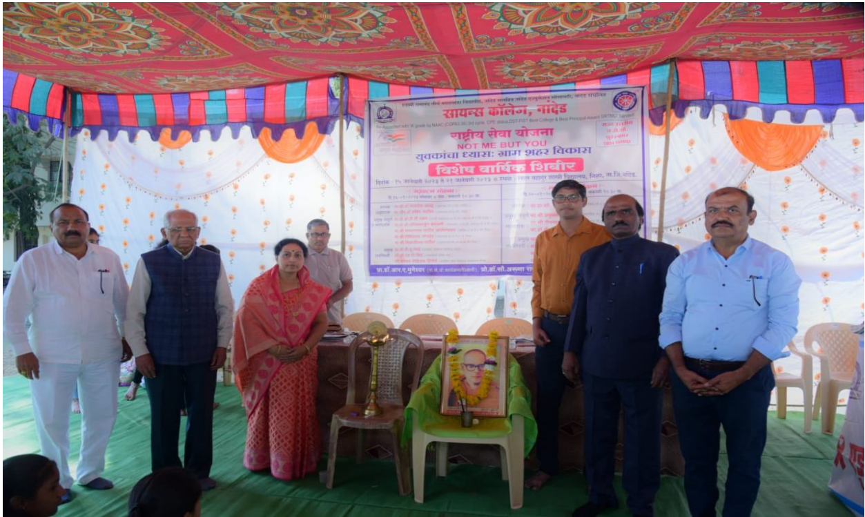
11.Special Guest Lecture on Women Empowerment in NSS Camp