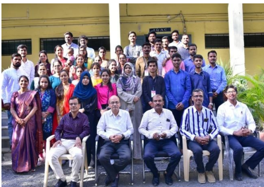
Department of Computer Science