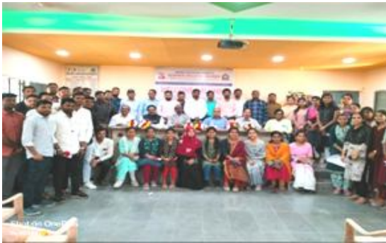
Department of Chemistry