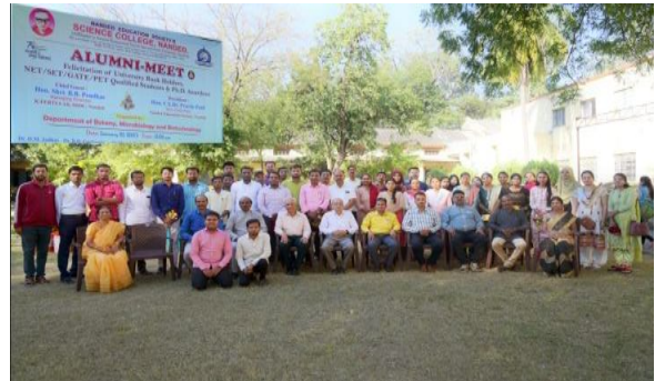
Department of Botany