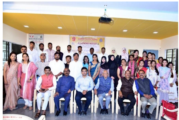
Department of Zoology & Fishery